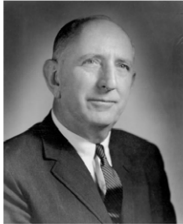
The late Sen. Richard Russell, Jr. (D-GA)

Interestingly, the initiator and one of the most ardent supporters of the filibuster against the bill was Senator Richard Russell (D. GA). Senator Russell commented on the bill: “We will resist to the bitter end any measure or any movement which would have a tendency to bring about social equality and intermingling and amalgamation of the races in our [Southern] states.” Ummm...., so where are the cancel culture Neanderthals demanding that the Russell Senate Office Building in Washington, D.C. – where scores of Democrat politicians now squat in opposition to the filibuster – be either renamed or razed? Huh?